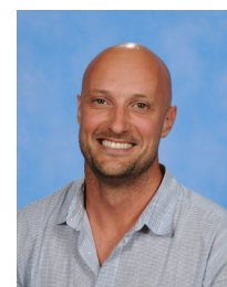
Mr Hollywood HT Computing (Rel.)